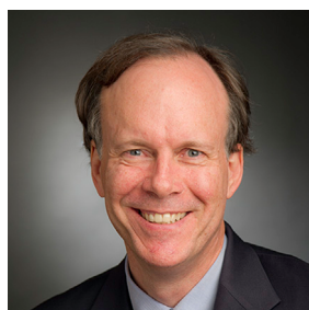
William G Kaelin Dana-Farber Cancer Institute, Harvard Medical School